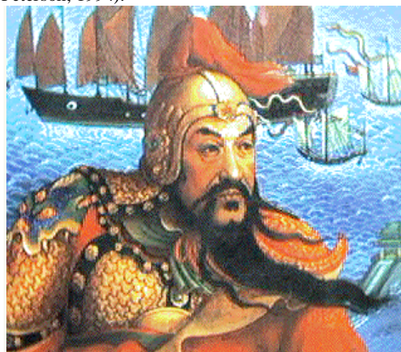
Figure (4) Admiral Zheng He.

During the Ming Dynasty (1368–1644 AD), the Hui navigator Zheng He (1371–1433 AD) (Figure 4) was a mariner, explorer, diplomat, and a fleet admiral of a Muslim Persian descent. In a span of 29 years, he commanded the largest wooden ship fleets ever sailing the seas as many as seven expeditionary voyages visiting more than 30 countries in Southeast and South Asia, the Middle East, and East Africa from 1405 to 1433 AD. These voyages were long neglected in official Chinese historical records until the publication of Liang Qihao's biography titled "Our Homeland's Great Navigator, Zheng He" in 1904. This unparalleled feat served to promote the friendship, as well as economic and cultural exchanges between China and those countries he visited. Zheng He was accompanied by Ma Huan and Ha San, also of Hui origin, who acted as his interpreters. Ma Huan provided a true account of Zheng He's visits in his book titled "Magnificent Tours of Lands Beyond the Ocean", which is of a major significance in the study of the history of communication between China and the Western civilization (The Hui Ethnic Minority, 2008, & Peterson, 1994).