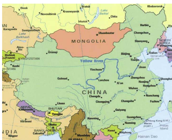
Figure (3) Yellow River.

worked together with the Hans; as well as people of other nationalities in reclaiming wasteland, farming and grazing pastures in the Yellow River surrounding areas, including the border regions. In the Liupan Mountain area, where land was distressed by serious water scarcity nearly every year; however, as a result of the allocation of funds for constructing water pumping station projects, especially in the regions of Haiyuan; Guyuan; and Tongxin; the people who live in these areas were able to extract water from the Yellow River and supply much needed water to the long-standing drought-stricken lands. The projects were aimed at providing a relief for the drinking water and irrigation water shortage in those regions for both the Hui and Han peoples similarly (The Hui Ethnic Minority, 2008).