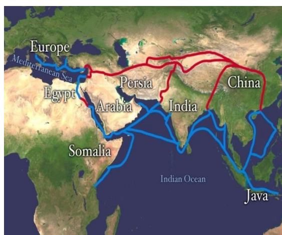
Figure (2) Silk Road Maritime Routes Map: Source: Wikipedia Maps: http://en.wikipedia.org/wiki/Silk_Road

which was a concept founded in the Indian scientific community coinciding with a period of intense Islamic trade from the Silk Road. Further, Elverskog, (2010) suggested that the most significant influence transpired in the 12 th century when a genre of abstract Islamic arts unexpectedly began to depict bodies of various human figures. This practice was for centuries considered prohibited by Islamic law. Mainly, it was credited to Muslim painters' experience in Buddhist iconic statues and Indian narrative artworks that they encountered on the Silk Road that led mosques starting to display non-Muslim artworks on depictive murals, and Islamic arts suddenly flourished with the adoption of new techniques and depicting of human figures (Islam's Influence on the Silk Roads, 2014).