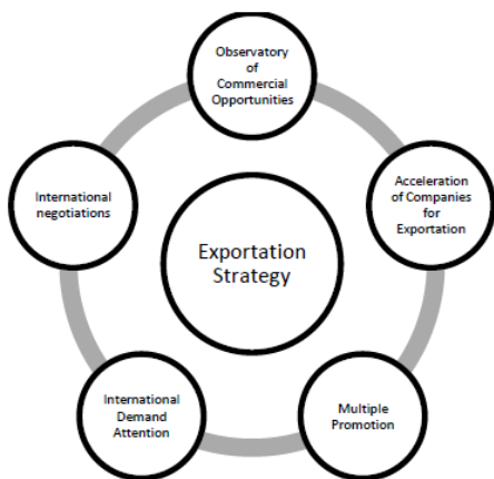
Fig. 2 Components of the Exportation Strategy

The five fundamental components of the strategy of internationalization of the SMEs manufacturing footwear of Leon leather are described below: