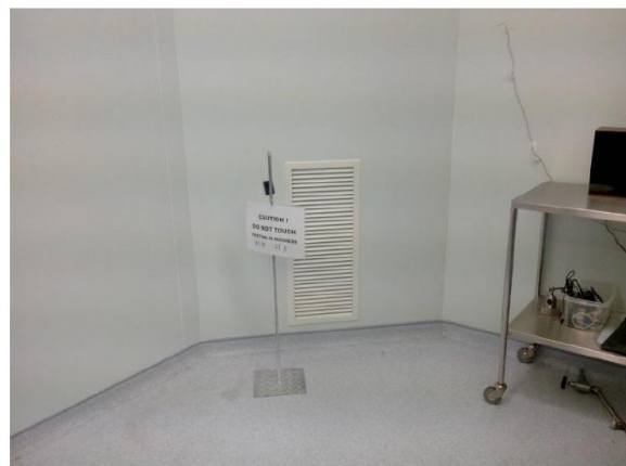
Figure 2: Placement of the instrument in the operating room

measurement. During the measurement, surgical procedures and other activities were conducted as usual.